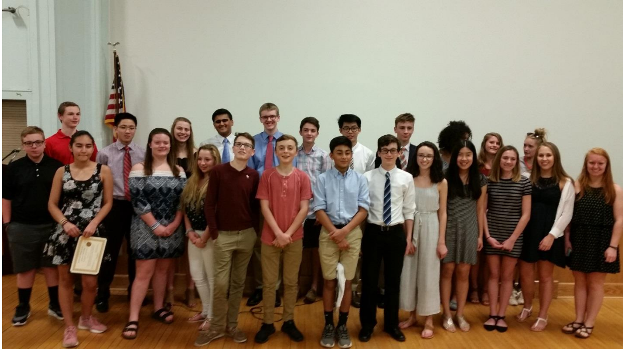
FIGURE 1. BETHLEHEM YOUTH COURT STUDENT VOLUNTEERS