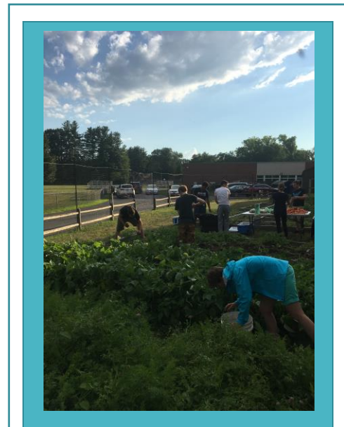
FIGURE 3. BYC AND BCMS GARDEN CLUB MEMBERS WORKING IN THE GARDEN.